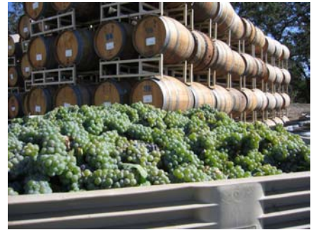
Sauvignon blanc grapes on the crush pad during 2005 harvest.