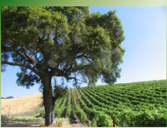
Live Oak Road Vineyard