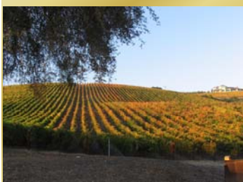
Fall at our Live Oak Road Vineyard